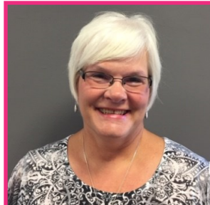
Sharon Manz Gift Shop