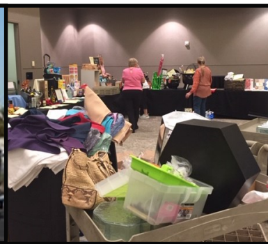
Let the seemingly endless display process begin