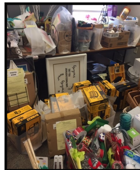
Auction items ready to be loaded onto U-Haul

Ever wondered what goes into planning a huge fundraiser? Months before the event, the SOC committee is busy asking for auction donations from individuals, businesses and of course our partners at Jennie. As the event draws near, auction items arrive and are photographed and categorized for the online auction database and for placement at the auction. Two days before the event a U-Haul truck rolls up to the loading dock where items for the golf outing (tents, tables, coolers, banners, chairs and tubs of supplies) are loaded onto the truck before auction items and staging supplies fill the remainder of the truck. A small army makes many trips to the loading dock to complete the loading process, only to unload it all at the MidAmerica Center where another group of workers are there to begin the staging process. Once auction items are off the truck, the remaining supplies head off to the golf course to be staged on the course early Saturday morning. On Sunday morning, carts and carts of supplies make their way through the hospital halls on their way to storage for next years event. Keep your calendars clear for August 1, 2020 and we'll do it all over again—hope to see you there!