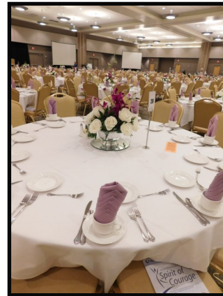
All ready for the guests to arrive