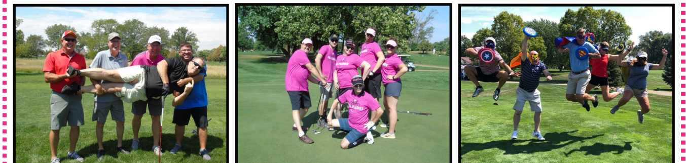
Silliness on the course was the theme for the day. It's safe to say...a good time was had by all!