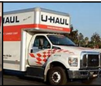
All loaded and headed to the MAC and Golf Course