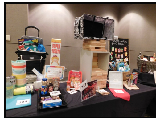
Auction items on display and ready for the bidding to begin

Ever wondered what goes into planning a huge fundraiser? Months before the event, the SOC committee is busy asking for auction donations from individuals, businesses and of course our partners at Jennie. As the event draws near, auction items arrive and are photographed and categorized for the online auction database and for placement at the auction. Two days before the event a U-Haul truck rolls up to the loading dock where items for the golf outing (tents, tables, coolers, banners, chairs and tubs of supplies) are loaded onto the truck before auction items and staging supplies fill the remainder of the truck. A small army makes many trips to the loading dock to complete the loading process, only to unload it all at the MidAmerica Center where another group of workers are there to begin the staging process. Once auction items are off the truck, the remaining supplies head off to the golf course to be staged on the course early Saturday morning. On Sunday morning, carts and carts of supplies make their way through the hospital halls on their way to storage for next years event. Keep your calendars clear for August 1, 2020 and we'll do it all over again—hope to see you there!