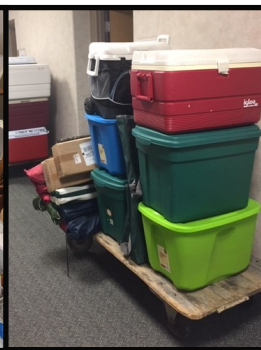
Golf Course items ready for U-Haul