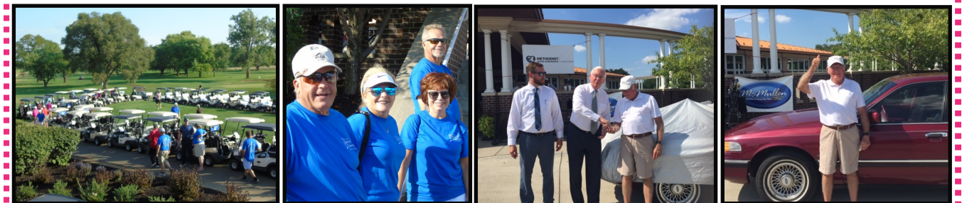
Just prior to the start